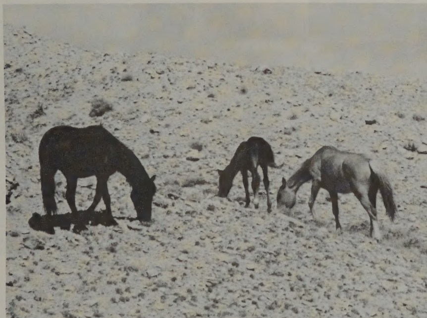
Sparse vegetation in some Pryor Mountain herd areas makes finding a meal a challenge for the wild horses.